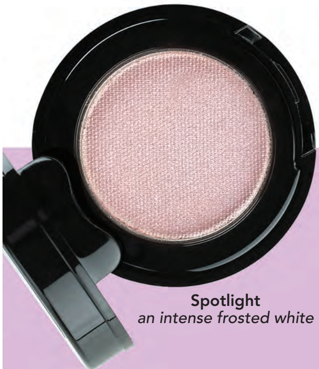
Spotlight an intense frosted white