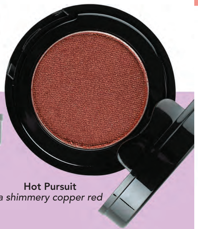
Hot Pursuit a shimmery copper red