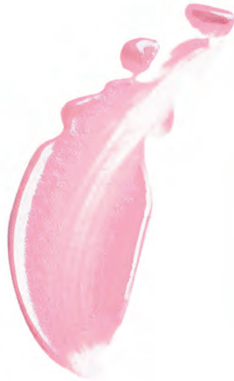
Pink Parfait a soft baby pink