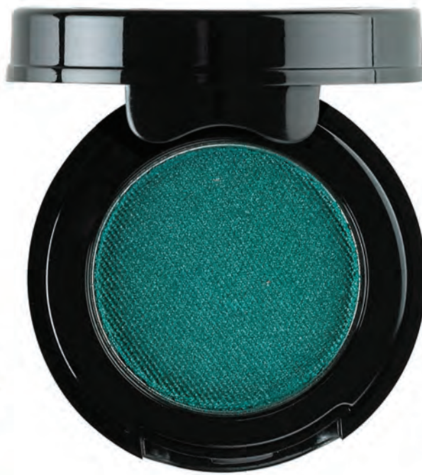
Under The Sea a jewel-toned turquoise