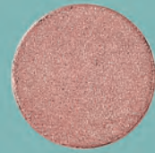
Soufflé a frosted mauve champagne