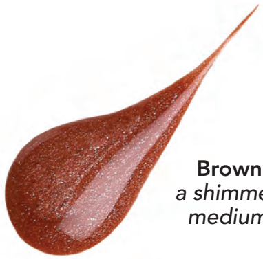
Brown Sugar a shimmery warm medium brown