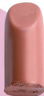
Quicksand (Matte) a sandy nude