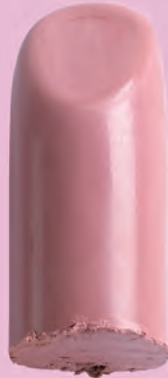
Affair (Luxury Creme) a soft nude pink