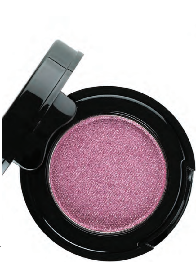
Pinky Up a high-shine hot pink

These shadows are here to shine! Soft, velvety texture glides on in one swipe.