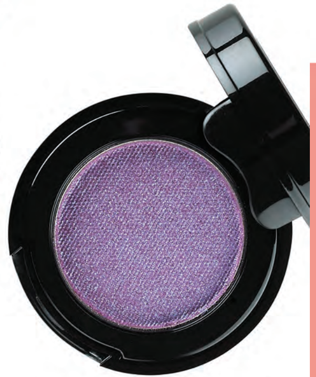
Unicorn an opalescent purple