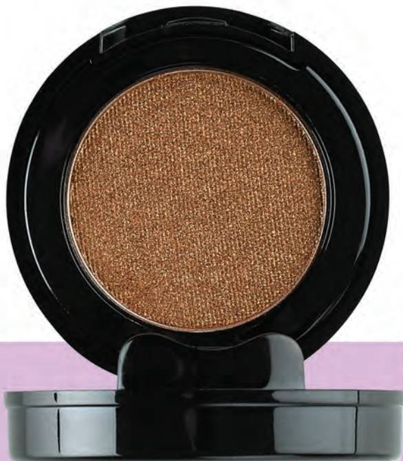
Golden Eye a foiled amber