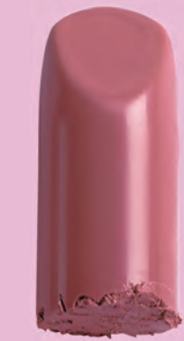
Amoré (Luxury Creme) a dusty rose