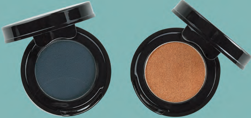
Covert a flat deep navy